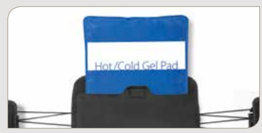
Hot/Cold Gel Pads