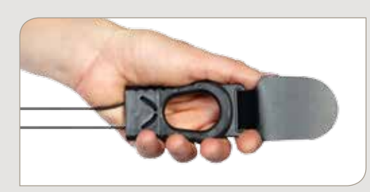
Ergonomic Hand Pulls